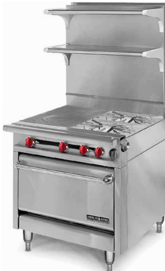
Model Shown HD34-IHT-2-1